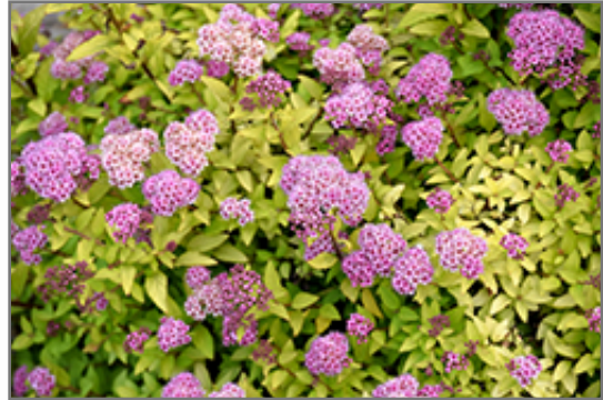
Sundrop Spirea flowers

Sundrop Spirea is recommended for the following landscape applications;