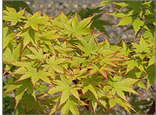
Coral Bark Japanese Maple foliage

Coral Bark Japanese Maple is recommended for the following landscape applications;