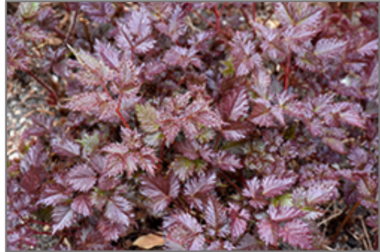
Delft Lace Astilbe foliage

Delft Lace Astilbe is a fine choice for the garden, but it is also a good selection for planting in outdoor pots and containers. With its upright habit of growth, it is best suited for use as a 'thriller' in the 'spiller-thriller-filler' container combination; plant it near the center of the pot, surrounded by smaller plants and those that spill over the edges. Note that when growing plants in outdoor containers and baskets, they may require more frequent waterings than they would in the yard or garden.