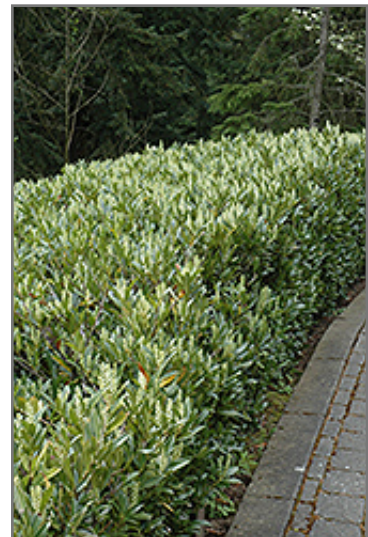
Otto Luyken Dwarf Cherry Laurel in bloom