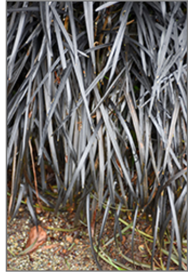
Black Mondo Grass foliage

Black Mondo Grass is a fine choice for the garden, but it is also a good selection for planting in outdoor pots and containers. It is often used as a 'filler' in the 'spiller-thriller-filler' container combination, providing a mass of flowers and foliage against which the thriller plants stand out. Note that when growing plants in outdoor containers and baskets, they may require more frequent waterings than they would in the yard or garden.