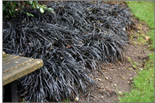
Black Mondo Grass

Black Mondo Grass is recommended for the following landscape applications;