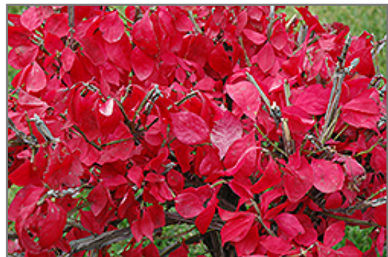
Compact Winged Burning Bush in fall