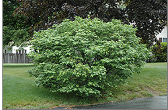
Compact Winged Burning Bush

Compact Winged Burning Bush will grow to be about 7 feet tall at maturity, with a spread of 7 feet. It tends to fill out right to the ground and therefore doesn't necessarily require facer plants in front, and is suitable for planting under power lines. It grows at a slow rate, and under ideal conditions can be expected to live for 50 years or more.