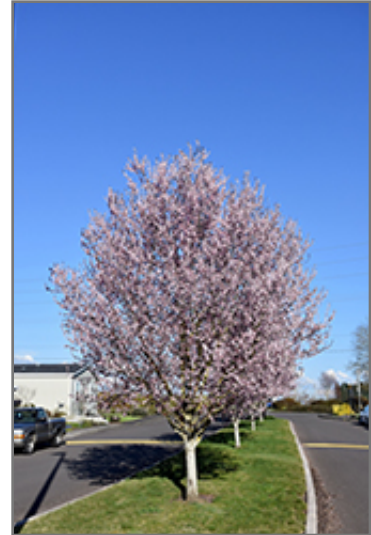
Krauter Vesuvius Plum in bloom

This tree will require occasional maintenance and upkeep, and is best pruned in late winter once the threat of extreme cold has passed. It is a good choice for attracting birds to your yard. Gardeners should be aware of the following characteristic(s) that may warrant special consideration;