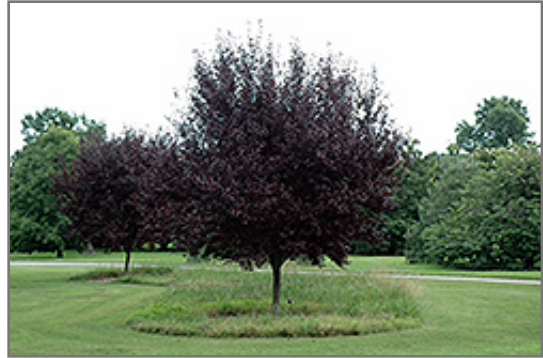
Krauter Vesuvius Plum

Krauter Vesuvius Plum will grow to be about 20 feet tall at maturity, with a spread of 12 feet. It has a low canopy with a typical clearance of 4 feet from the ground, and is suitable for planting under power lines. It grows at a medium rate, and under ideal conditions can be expected to live for approximately 30 years.