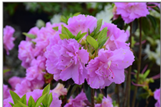
Elsie Lee Azalea flowers