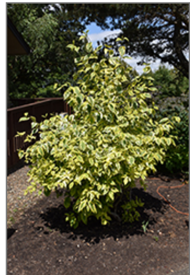
Hedgerows Gold Variegated Red-Twig Dogwood