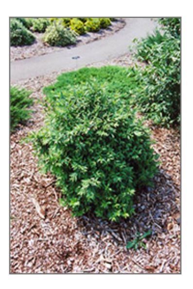
Lodense Common Privet