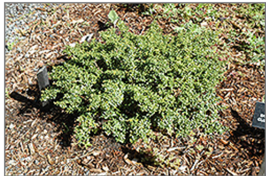
Lemon Gem Dwarf Japanese Holly