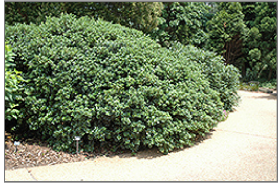
Roundleaf False Holly

Roundleaf False Holly is recommended for the following landscape applications;