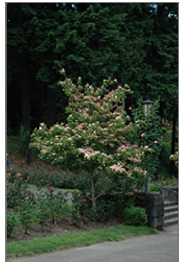
Heart Throb Chinese Dogwood in bloom