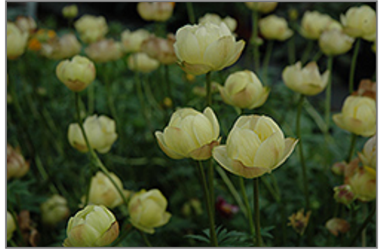
Cheddar Globeflower flowers