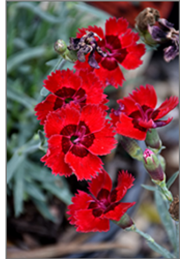
Fire Star Pinks flowers

Fire Star Pinks is recommended for the following landscape applications;