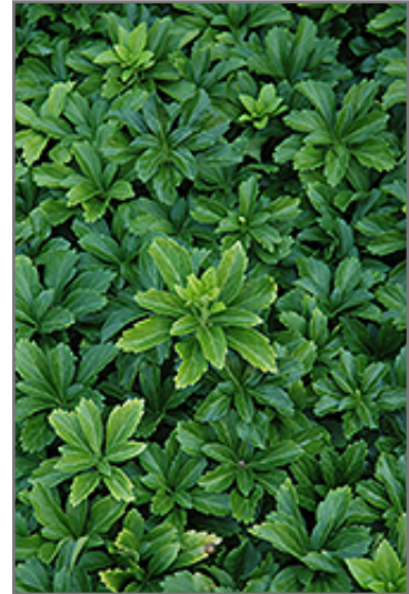
Green Sheen Japanese Spurge foliage