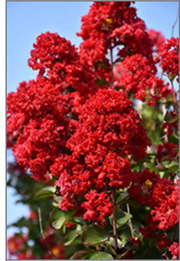
Dynamite Crapemyrtle flowers