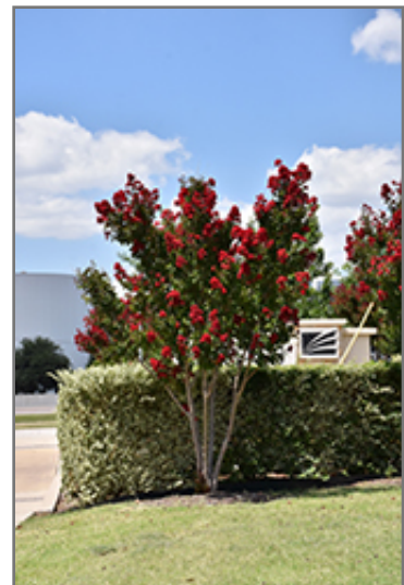
Dynamite Crapemyrtle in bloom