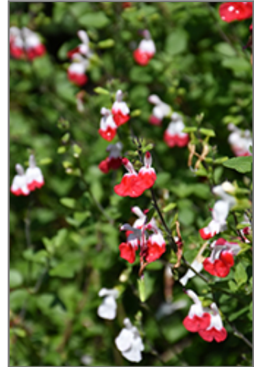
Hot Lips Sage flowers

Hot Lips Sage is a fine choice for the garden, but it is also a good selection for planting in outdoor pots and containers. With its upright habit of growth, it is best suited for use as a 'thriller' in the 'spiller-thriller-filler' container combination; plant it near the center of the pot, surrounded by smaller plants and those that spill over the edges. It is even sizeable enough that it can be grown alone in a suitable container. Note that when growing plants in outdoor containers and baskets, they may require more frequent waterings than they would in the yard or garden.