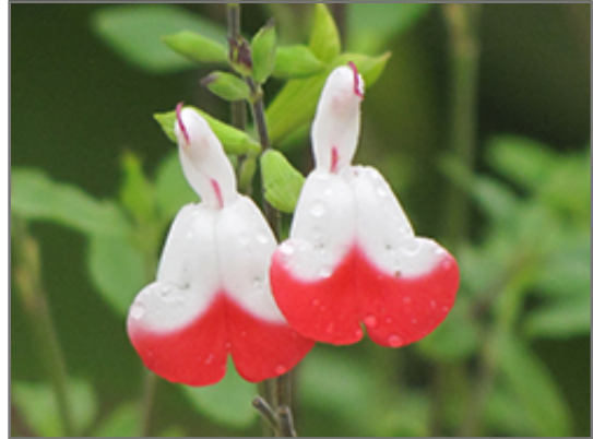
Hot Lips Sage flowers

Hot Lips Sage is an herbaceous evergreen perennial with an upright spreading habit of growth. Its relatively fine texture sets it apart from other garden plants with less refined foliage.