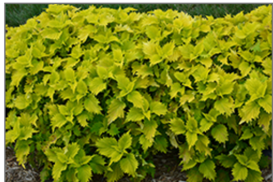
Wasabi Coleus