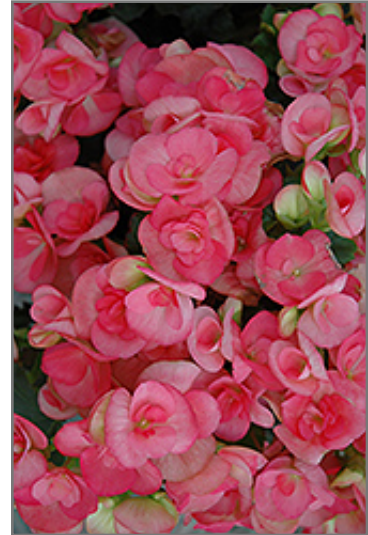
Netja Dark Begonia flowers