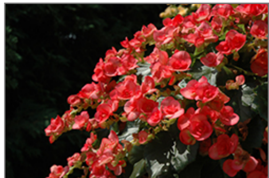
Netja Dark Begonia flowers