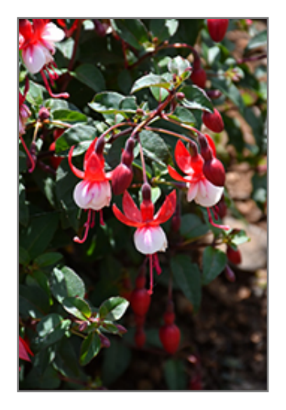
Santa Claus Fuchsia flowers

1020 S 42nd St Springfield, OR 97478 (541) 744-0372 littleredfarmnursery.com