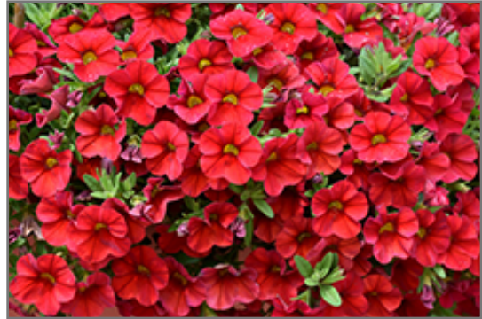
Superbells Red Calibrachoa flowers

Superbells Red Calibrachoa is recommended for the following landscape applications;