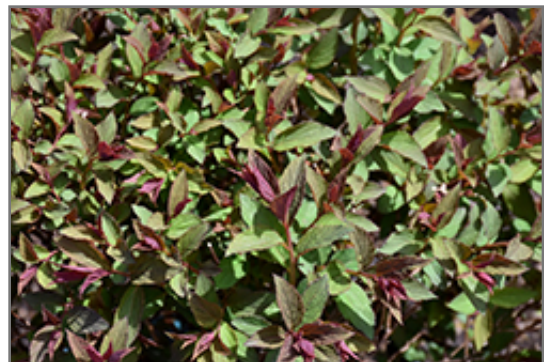
Double Play Artisan Spirea foliage