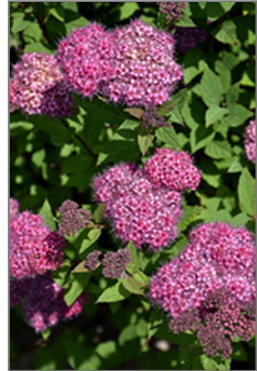
Double Play Artisan Spirea flowers

This shrub will require occasional maintenance and upkeep, and is best pruned in late winter once the threat of extreme cold has passed. It is a good choice for attracting butterflies to your yard, but is not particularly attractive to deer who tend to leave it alone in favor of tastier treats. It has no significant negative characteristics.