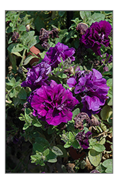
Double Wave Blue Velvet Petunia flowers