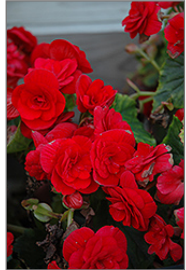
Barkos Begonia flowers

Barkos Begonia is recommended for the following landscape applications;