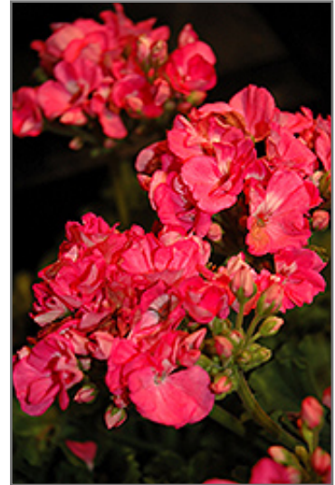
Rocky Mountain Pink Geranium flowers