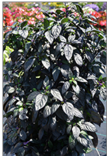
Black Pearl Ornamental Pepper