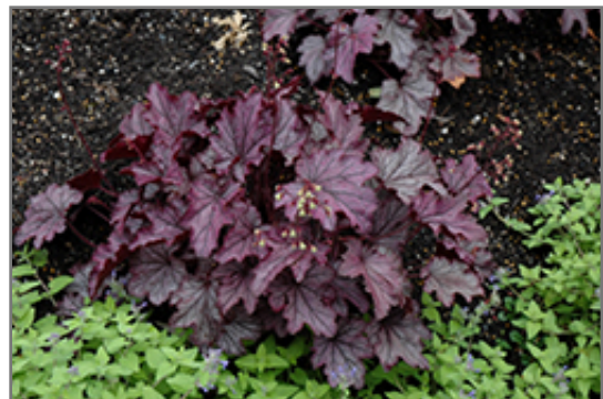
Spellbound Coral Bells