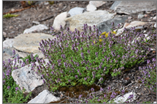
Lemon Thyme in bloom

This plant is quite ornamental as well as edible, and is as much at home in a landscape or flower garden as it is in a designated herb garden. It should only be grown in full sunlight. It prefers to grow in average to dry locations, and dislikes excessive moisture. It is considered to be drought-tolerant, and thus makes an ideal choice for a low-water garden or xeriscape application. It is not particular as to soil type or pH. It is highly tolerant of urban pollution and will even thrive in inner city environments. Consider covering it with a thick layer of mulch in winter to protect it in exposed locations or colder microclimates. This particular variety is an interspecific hybrid. It can be propagated by division; however, as a cultivated variety, be aware that it may be subject to certain restrictions or prohibitions on propagation.