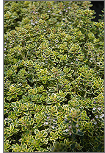
Lemon Thyme foliage

Lemon Thyme is smothered in stunning spikes of lilac purple flowers rising above the foliage from early to late summer. Its attractive tiny fragrant round leaves remain light green in color throughout the year.