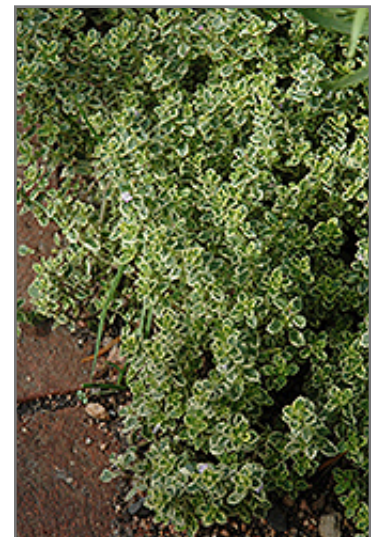
Aureus Lemon Thyme foliage