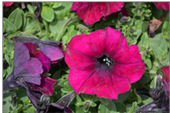
Easy Wave Burgundy Velour Petunia flowers