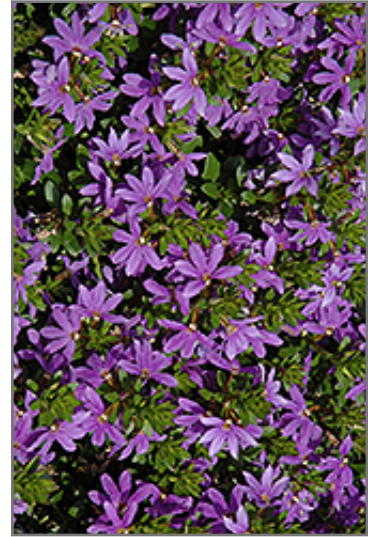
Brilliant Fan Flower flowers