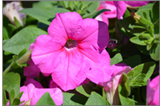
Easy Wave Pink Passion Petunia flowers

Easy Wave Pink Passion Petunia is recommended for the following landscape applications;