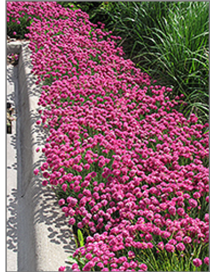
Dusseldorf Pride Sea Thrift in bloom

Dusseldorf Pride Sea Thrift is recommended for the following landscape applications;