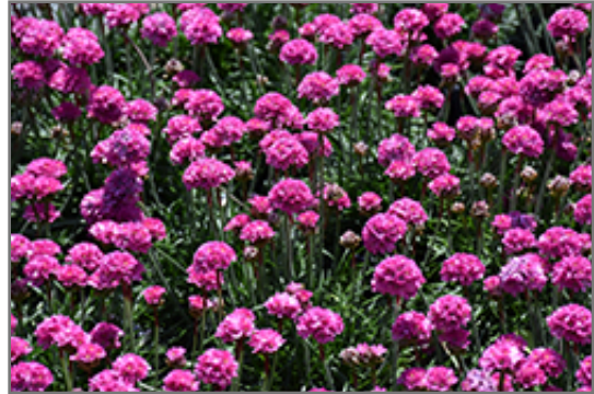
Dusseldorf Pride Sea Thrift flowers

Dusseldorf Pride Sea Thrift will grow to be only 6 inches tall at maturity extending to 8 inches tall with the flowers, with a spread of 8 inches. Its foliage tends to remain low and dense right to the ground. It grows at a slow rate, and under ideal conditions can be expected to live for approximately 10 years. As an evergreen perennial, this plant will typically keep its form and foliage year-round.