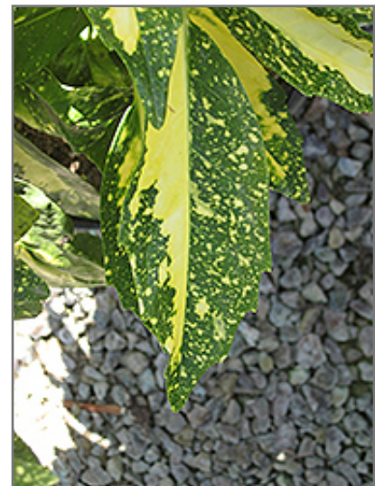
Variegated Japanese Aucuba foliage