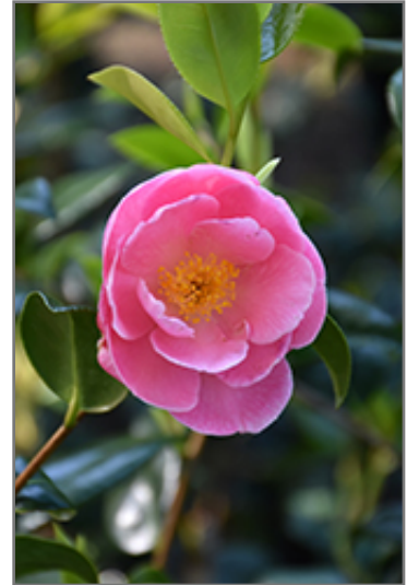
Pink Icicle Camellia flowers