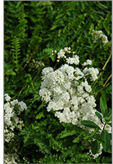
Double Dropwort flowers

Clusters of small white double flowers rise tall above a base of deep green toothy foliage; low maintenance plants, great for borders, beds, containers or used in fresh-cut arrangements; drought tolerant once established