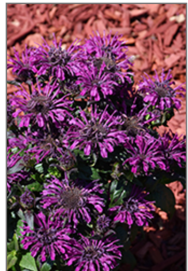
Rockin' Raspberry Beebalm flowers