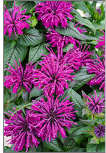
Rockin' Raspberry Beebalm flowers

This plant will require occasional maintenance and upkeep, and should be cut back in late fall in preparation for winter. It is a good choice for attracting bees, butterflies and hummingbirds to your yard, but is not particularly attractive to deer who tend to leave it alone in favor of tastier treats. Gardeners should be aware of the following characteristic(s) that may warrant special consideration;