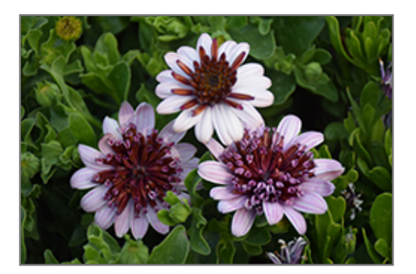
4D Berry White African Daisy flowers