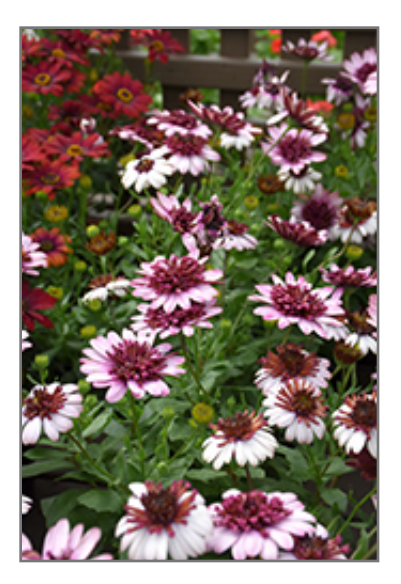
4D Berry White African Daisy flowers