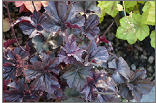
Obsidian Coral Bells foliage

Obsidian Coral Bells is recommended for the following landscape applications;