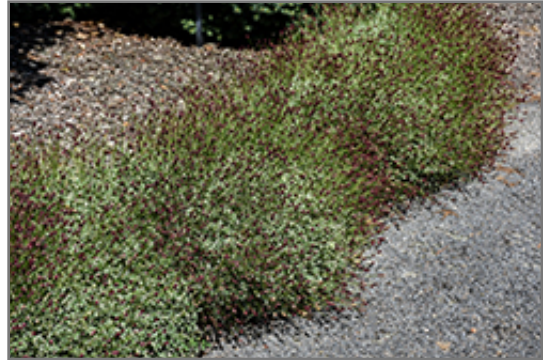
Little Angel Burnet in bloom