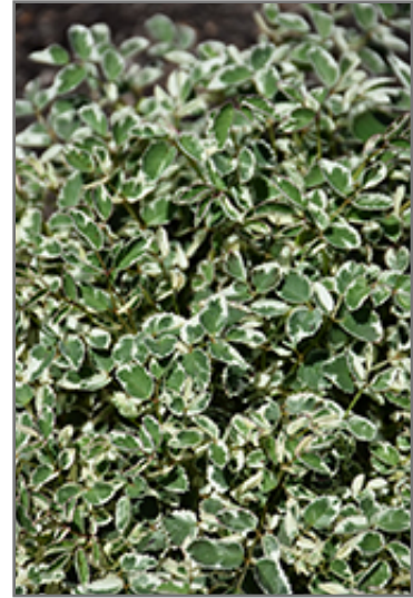
Little Angel Burnet flowers

Little Angel Burnet will grow to be only 4 inches tall at maturity extending to 10 inches tall with the flowers, with a spread of 14 inches. When grown in masses or used as a bedding plant, individual plants should be spaced approximately 12 inches apart. It grows at a medium rate, and under ideal conditions can be expected to live for approximately 15 years. As an herbaceous perennial, this plant will usually die back to the crown each winter, and will regrow from the base each spring. Be careful not to disturb the crown in late winter when it may not be readily seen!