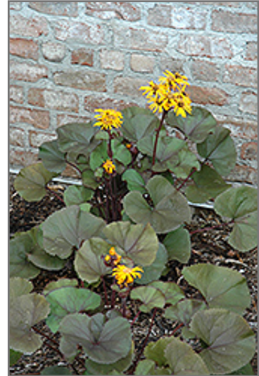
Britt Marie Crawford Rayflower in bloom