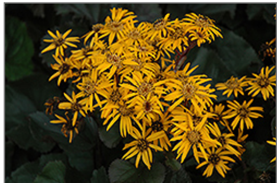
Britt Marie Crawford Rayflower flowers