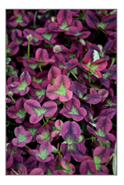
Limerick Isabella Clover foliage