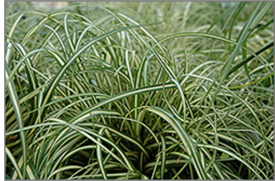
Evergold Variegated Japanese Sedge foliage

Evergold Variegated Japanese Sedge is recommended for the following landscape applications;