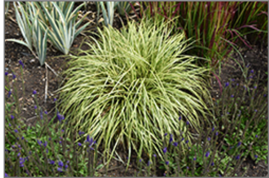
Evergold Variegated Japanese Sedge foliage

Evergold Variegated Japanese Sedge will grow to be about 8 inches tall at maturity, with a spread of 12 inches. Its foliage tends to remain low and dense right to the ground. It grows at a medium rate, and under ideal conditions can be expected to live for approximately 10 years. As an evergreen perennial, this plant will typically keep its form and foliage year-round.