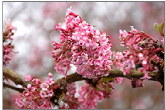
Dawn Viburnum flowers

Dawn Viburnum is recommended for the following landscape applications;