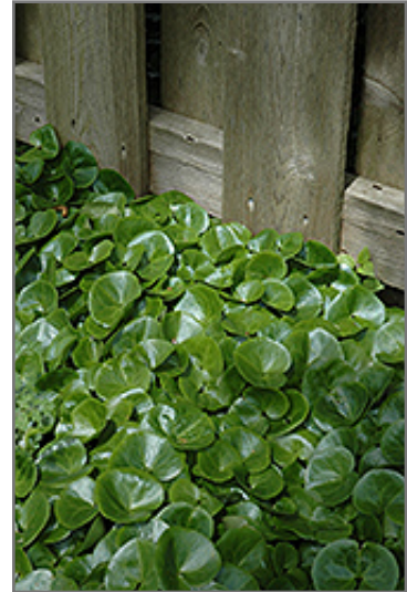
European Wild Ginger