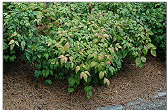
Fire Power Nandina