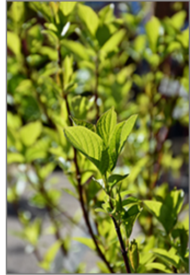
Bailey Red-Twig Dogwood foliage

This shrub does best in full sun to partial shade. It is an amazingly adaptable plant, tolerating both dry conditions and even some standing water. It is not particular as to soil type or pH. It is highly tolerant of urban pollution and will even thrive in inner city environments. This species is native to parts of North America.