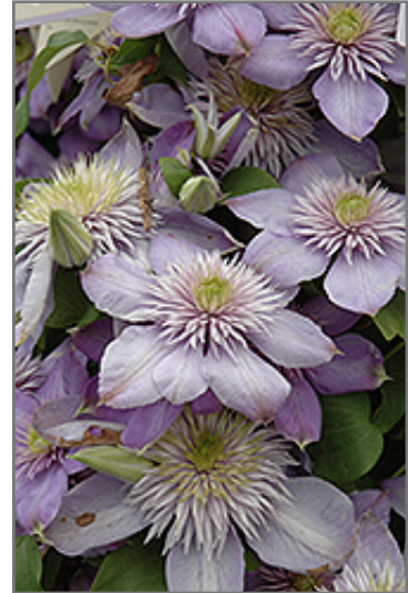
Blue Light Clematis flowers

This is a relatively low maintenance woody vine. It is a Type 2 clematis, which means it will bloom primarily on old wood of the previous season, with a second flush later in summer. Dead and weak vines should be removed in late winter, and remaining vines should be trimmed back to the first buds that are seen to remove dead stems. It is a good choice for attracting bees and hummingbirds to your yard. It has no significant negative characteristics.