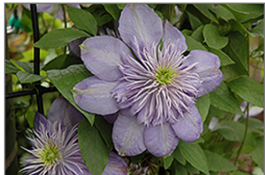
Blue Light Clematis flowers