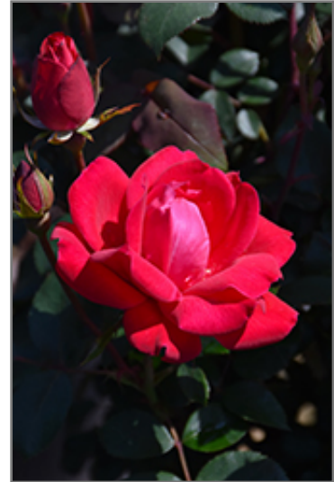
Double Knock Out Rose flowers